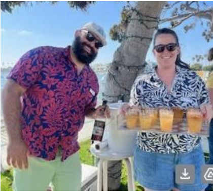
Free tropical drinks!