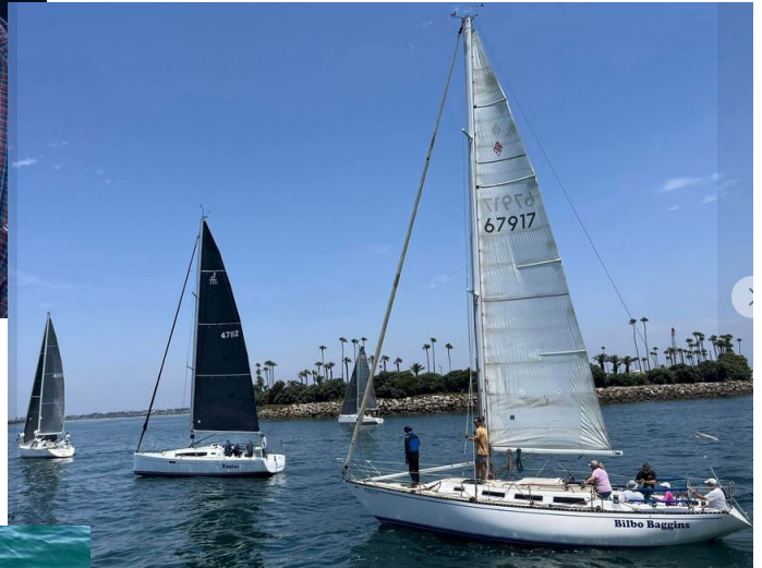
The 3 racers arriving for the race.