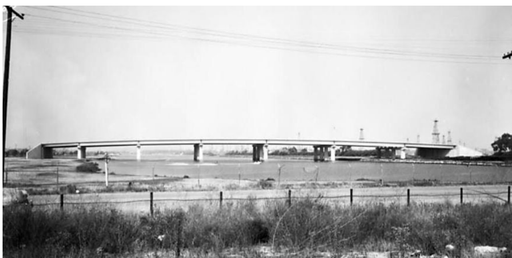
The old 2nd St bridge built in 1956 with no approaches (the bridge to nowhere). It was completed in 1959 connecting Naples and PCH.